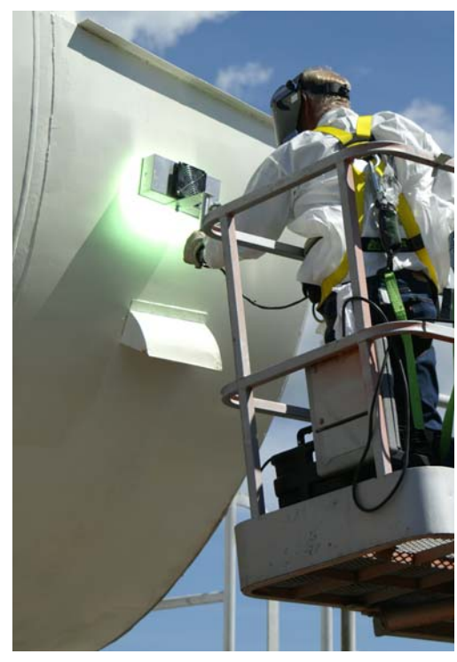
Figure 2. Field Application And Cure Of UV Technology At Warm Temperatures

With complete final properties obtained in a matter of seconds under a UV lamp, this fast cure presents a tremendous advantage in expanding the conditions in which it is possible to conduct painting operations for field-applied coatings. Cure within seconds provides many advantages, including time savings and improved efficiency and higher quality coatings due to the elimination of long cure periods when temperature, humidity, or other factors could cause damage to uncured coatings. In addition to complete cure at low temperatures that is currently impossible with conventional paints, it is also possible to apply and cure UV coatings even when rain is expected shortly. This is especially advantageous at hot summertime locations where conditions are often ideal in the morning and rainy in the afternoon. With UV technology, after UV cure the coating has full properties and will be unaffected by rain, unlike conventional materials.