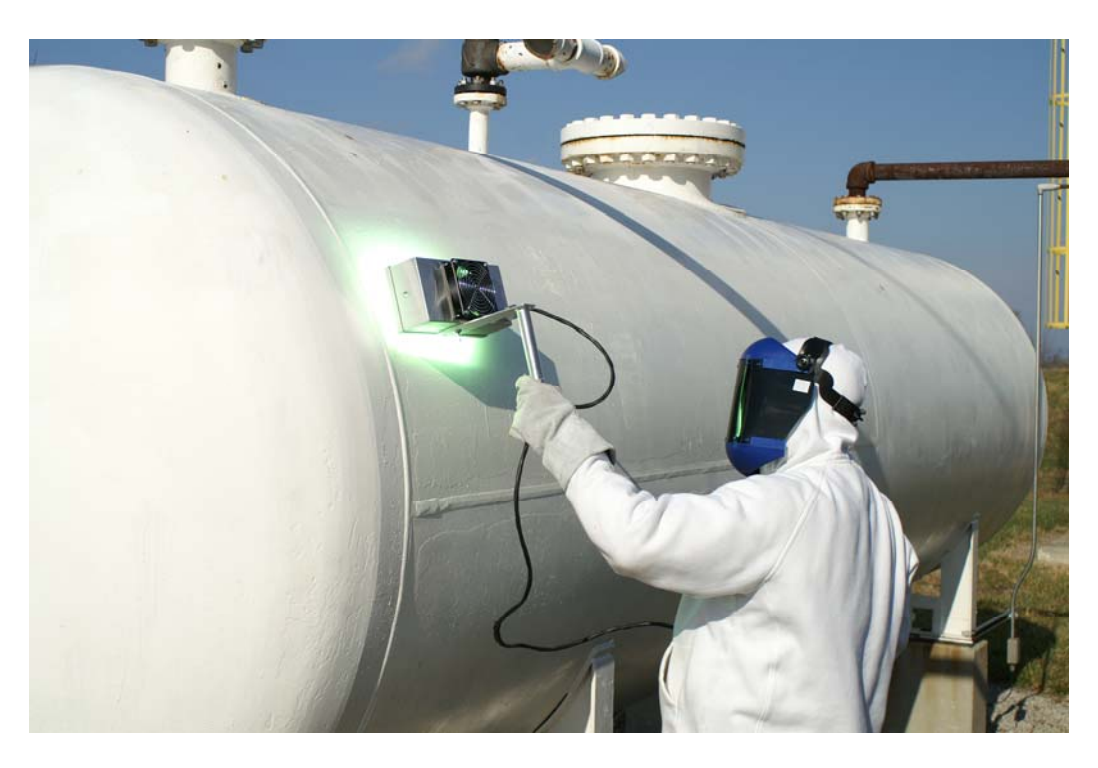
Figure 1. Field Application And Cure Of UV Technology At Cold Temperatures

With improvements in the technology of portable hand-held UV lamps, field application and cure of high performance corrosion resistant UV coatings is now possible for even the largest of structures, with a UV lamp passed over the surface slowly in the same manner as a surface is painted with a spray gun or roller. Just as any surface can be painted with only a few individuals spray-painting or rolling, a UV coating can be applied and cured on that same surface by only a few individuals applying paint and following with a UV lamp. An efficient process can be performed with one person applying paint and another following with a UV lamp, each with proper protective shielding as shown by the painter in Figure 1. Cure is achieved with a motion that can be described as "painting" the surface with the hand-held UV light, passing the light over the surface slowly in the same manner as a surface is painted with a roller or spray gun, with the movement of the lamp taking approximately the same amount of time as applying paint to the surface. For large surfaces, multiple painters and multiple lights can be used.